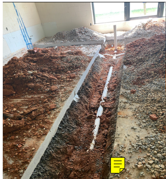
Continue Underground plumbing in area 2