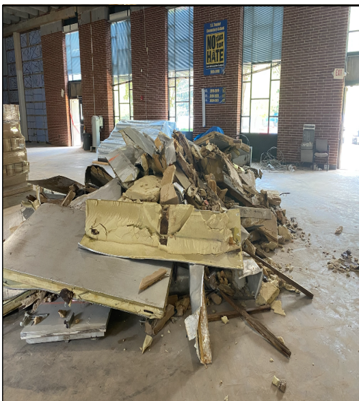
Cooler freezer demo is complete