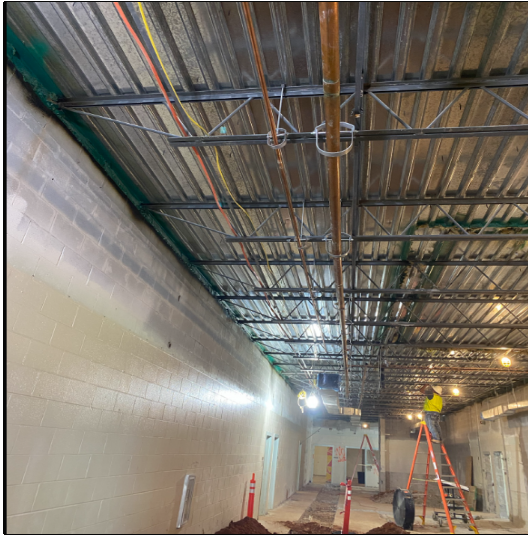
Continue installing refrigerant piping overhead