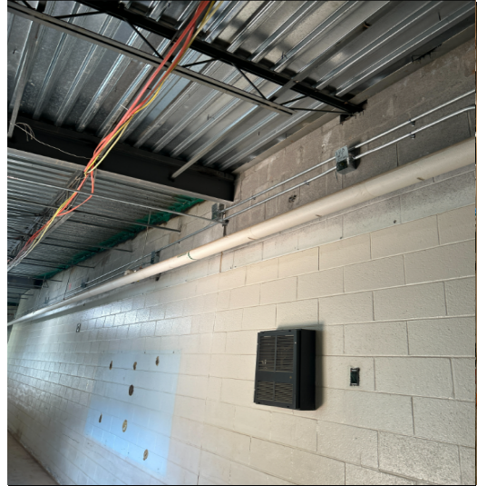
Continue installing new conduit overhead